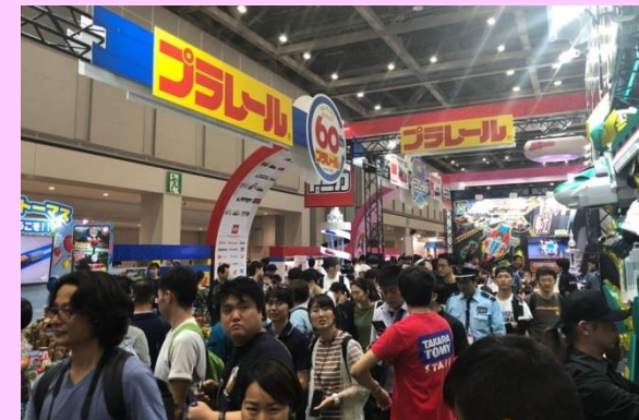
Many families were at each Tomy booth