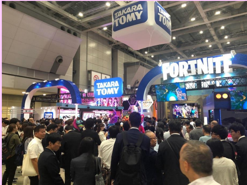
Business days : Many visitors came in Takara Tomy booth at the 10 am (Opening time)

40,000 are the Largest class of visitors of Takara Tomy booth. There were 14 shows on Takara Tomy own stage and these were popular. Not only displayed toys, kids could actually play the toys at each section.