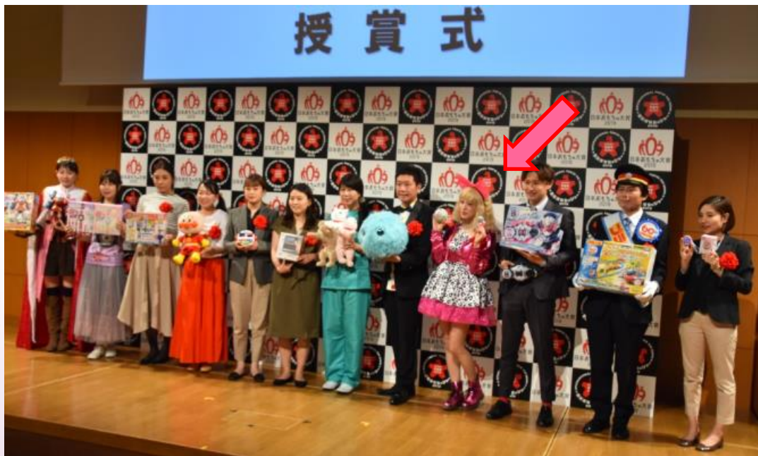
Ceremony of the award

L.O.L. Surprise! Series2 7 Surprise! won the award of Greatest Sales of Last year!!!!