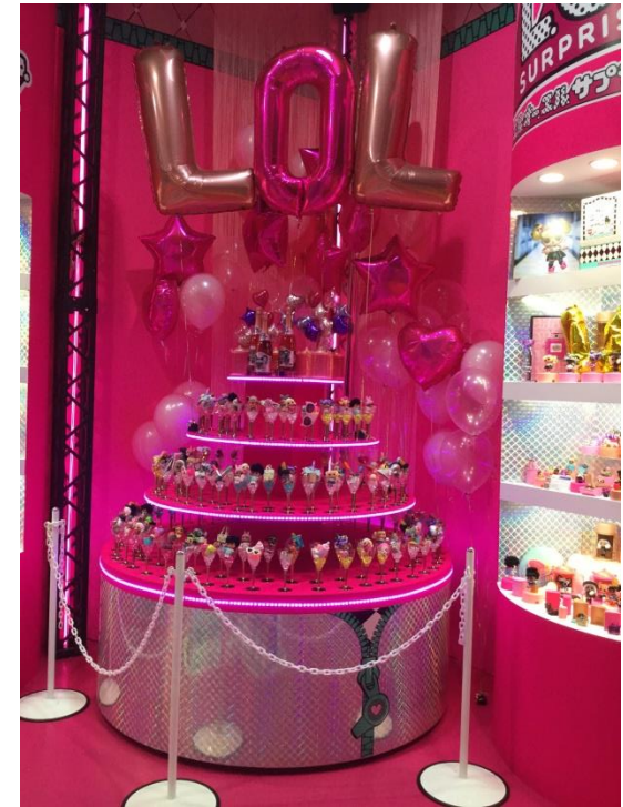
#P!nk Pink P!nk booth

#Displayed all L.O.L surprise! From Series.1 to Eye-Spy, and special appeal for Hair Goal launched on July.7 th !!!