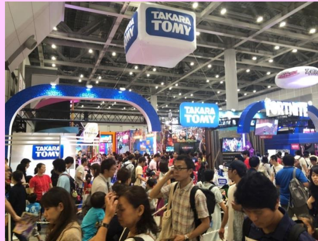
Public Days: It was crowd around entrance and stage area.